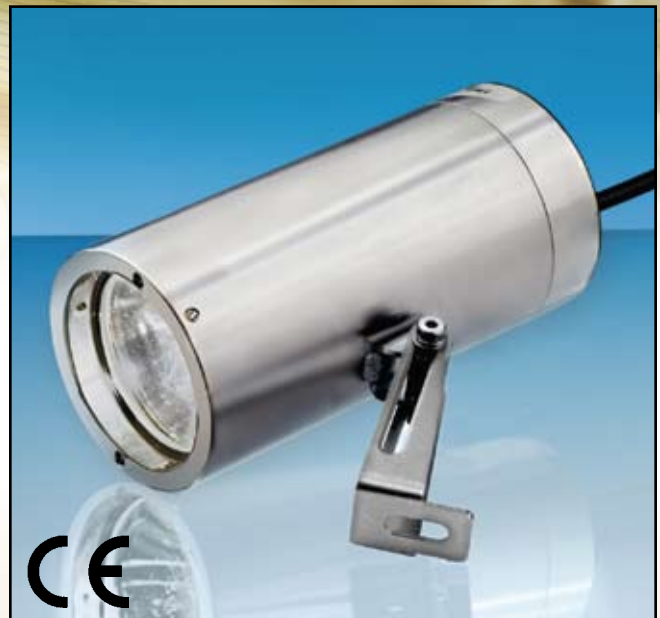
Lumiglas luminaire USL 16-LED with Mounting Bracket