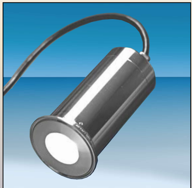
Lumiglas luminaire USL 36-LED with MetaClamp Sanitary Clamp Connection