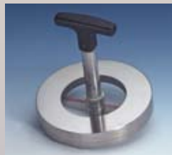
Type 73.SW: Sight Glass Discs with Wiper