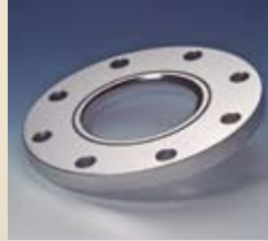
Type 19.BIO: Bolt On Sight Glass for Sterile Applications O-Ring Seal