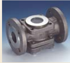
Type 77: Sight Glass Discs for Visual Flow Indicator Fittings