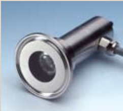
Type 80.USL01: MetaClamp® Sanitary Clamp Fitting with USL-01 Luminaire