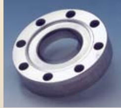
Type 19.CF: Sight Glass Discs for ConFlat high vacuum applications