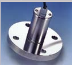
Type 19.BIO.USL33: Bolt On Sight Glass for Sterile Applications using Sight Glass Luminaires or USL-33