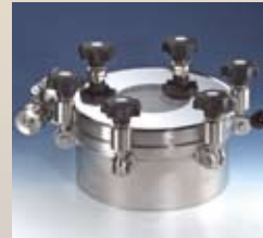
Type 99.ZIM: Pressure Manway with Integrated Metaglas