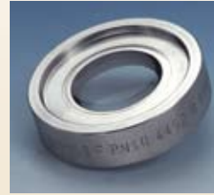
Type 74: Sight Glass Discs with Tongue and Groove Joint