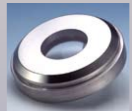
Type 83: Sight Glass Discs for Aseptic Screwed Pipe Connection DIN 11864