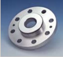
Type 903: Sight Glass Discs for Sterile Applications, stepped for flush mount