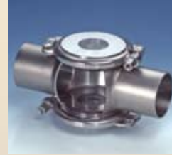
Type 99.TUC: Sight Glass with Luminaire for Varivent-In-Line Fittings