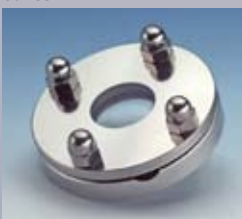
Type 99.NA: Sight Glasses for Flush Mount Hygienic Weld Pad