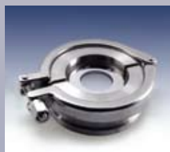
Type 80.TCI.CC: Sight Glasses for Clamp Style Flush Mount