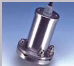
Type 99.NA.USL33: Sight Glasses for NA-Connect Fitting with USL-33