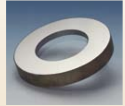
Type 76: Sight Glass Discs for ANSI Flange connection