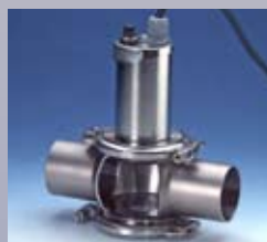
Type 99.TUC.USL33: Sight Glass with USL-33 Luminaire for Varivent-In-Line Fittings