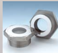
Type 61: Threaded Sight Glasses - Hexagon head, NPT or other threads