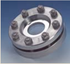
Type 73: Sight Glass Discs for DIN 28120 and other weld type assemblies