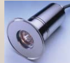
Type 80.ESL25: Sight Glasses for Use with Clamp Connections and Sight Glass Luminaire ESL-25 EX