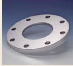
Type 13: Sight Glass for ANSI Flange Connection type full face