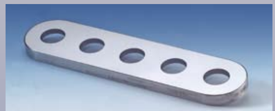
Type 99.LSG: Fused Metal Elongated Sight Glass for Rectangular & Obround Sight Windows and Armored Liquid Level Gages