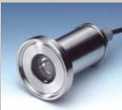
Type 83.USL33: Sight Glass Discs for Aseptic Screwed Pipe Connection DIN 11864-1 for Mounting Luminaires USL-33