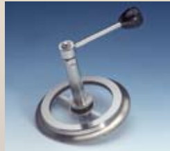
Type 80.SW: MetaClamp® - with Wiper