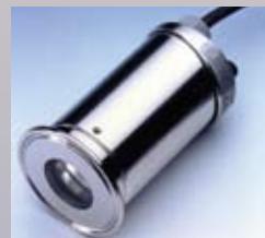
Type 80.USL33: MetaClamp® Sanitary Clamp Fitting with USL-33 Luminaire