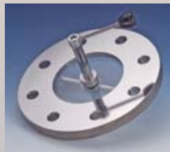
Type 13.SW: Sight Glass Flange - with Wiper