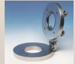
Type 80.SC: High Pressure Hinged with O-Ring Seal