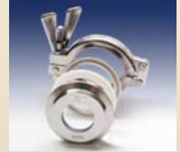
Type 80: MetaClamp® Sanitary Clamp Fitting