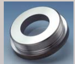
Type 64: Threaded Sight Glasses - Round head