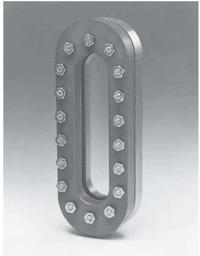
Obround Weld Pad Gages